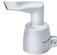
Flat Angled Nozzle 20x2 mm, 100° PN: 106934900