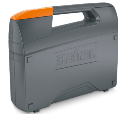
Heavy Duty Case for 20s Series Tools PN: 110036523