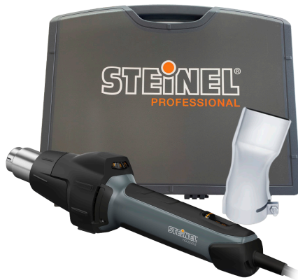
Roofing Kit PN: 110078501