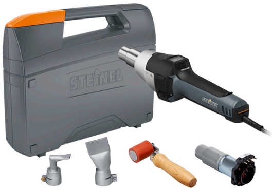
Roofing Kit PN: 110053227