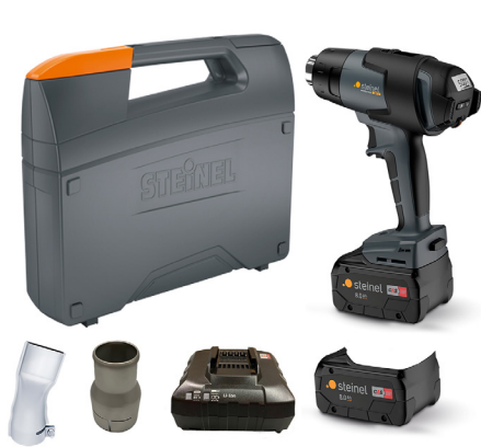
Mobile Heat 5 Roofing Kit PN: 110086088