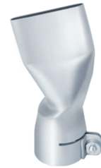
Flat Angled Nozzle 40x2 mm PN: 110049712