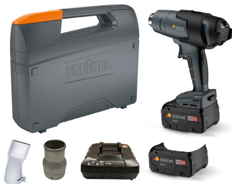
Mobile Heat 3 Roofing Kit PN: 110086091