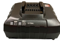
Battery Charger PN: 110081184