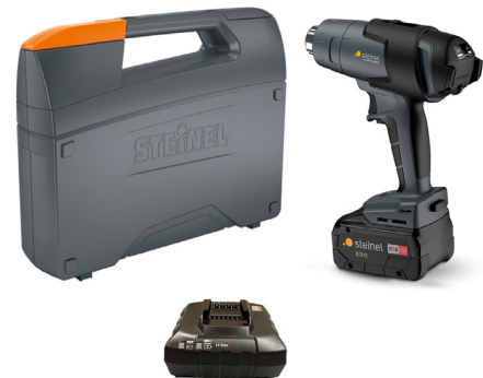
Mobile Heat 3 Kit PN: 110084904