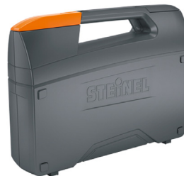
Mobile Heat 5 Kit PN: 110084905