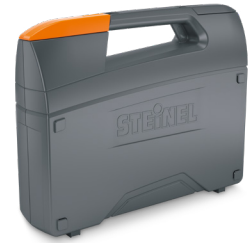
Heavy Duty Case for 20s Series Tools PN: 110036523

All industrial clamp nozzles fit onto this adapter and work with STEINEL's electronic heat tools, including the HL 1920 E, HL 2020 E, HG 2220 E and the HG 2320 E/ESD.