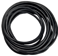
21 FT Power Cord No Strain Relief PN: 110059546