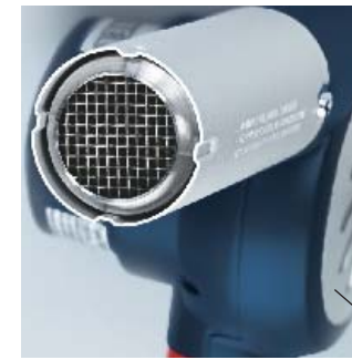
Self-cooling aluminum output tube with mesh guard for safety