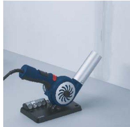
Dry paint, wall emulsion, filler etc.