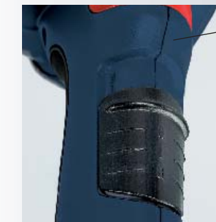
Slide switch with cool air stage for rapid cool down