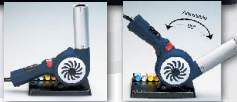
Fully adjustable quick-lock stand conveniently stores temperature keys. Tool removes easily for hand-held operation.