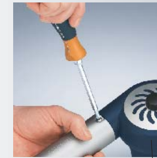
Long life heating element with plug-in feature is quick and easy to change