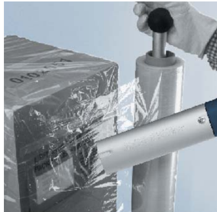
Shrink wrap, packaging ...