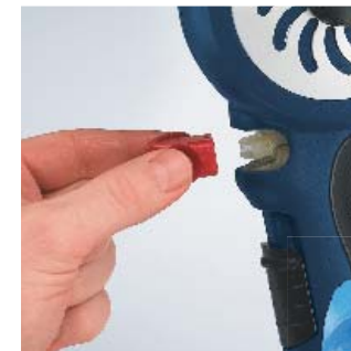
Plug-in keys are easily interchangeable